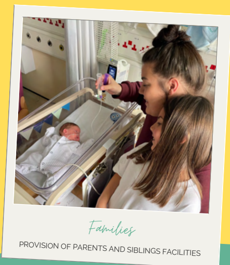
Families PROVISION OF PARENTS AND SIBLINGS FACILITIES