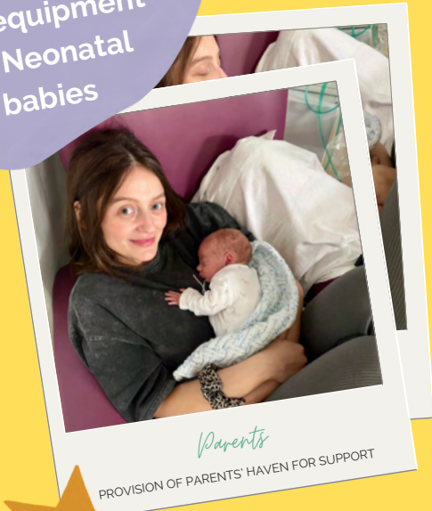
Parents PROVISION OF PARENTS' HAVEN FOR SUPPORT

Raising funds to provide facilities and equipment for Neonatal babies