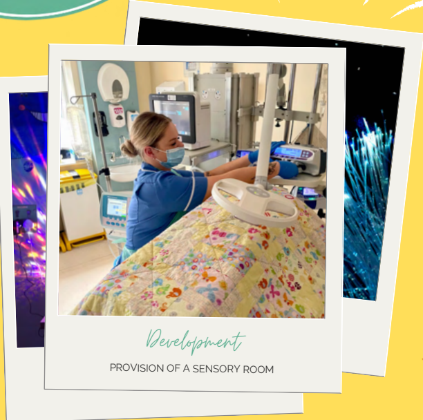
Development PROVISION OF A SENSORY ROOM