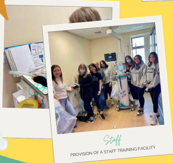
Staff PROVISION OF A STAFF TRAINING FACILITY